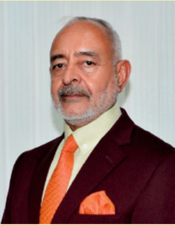
(Admiral D K Joshi)

PVSM, AVSM, YSM, NM, VSM (Retd.) Lieutenant Governor Andaman & Nicobar Islands &